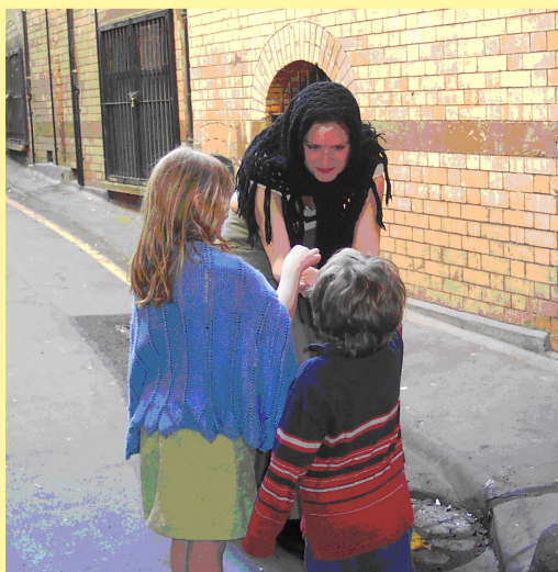
The beggar woman collecting alms.

The walk will take the form of an interactive guided tour where groups of children will be shown the sites of Tudor Bristol and meet some of the characters such as the beggar woman, ship's captain and ratcatcher who lived and worked in 16th century Bristol.