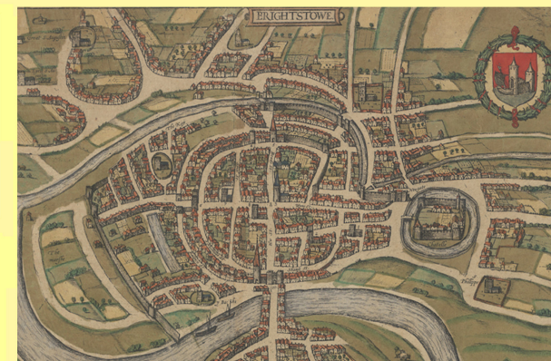
Hoefnagle's map of Bristol, 1581 courtesy of Bristol's Museums, Galleries & Archives.