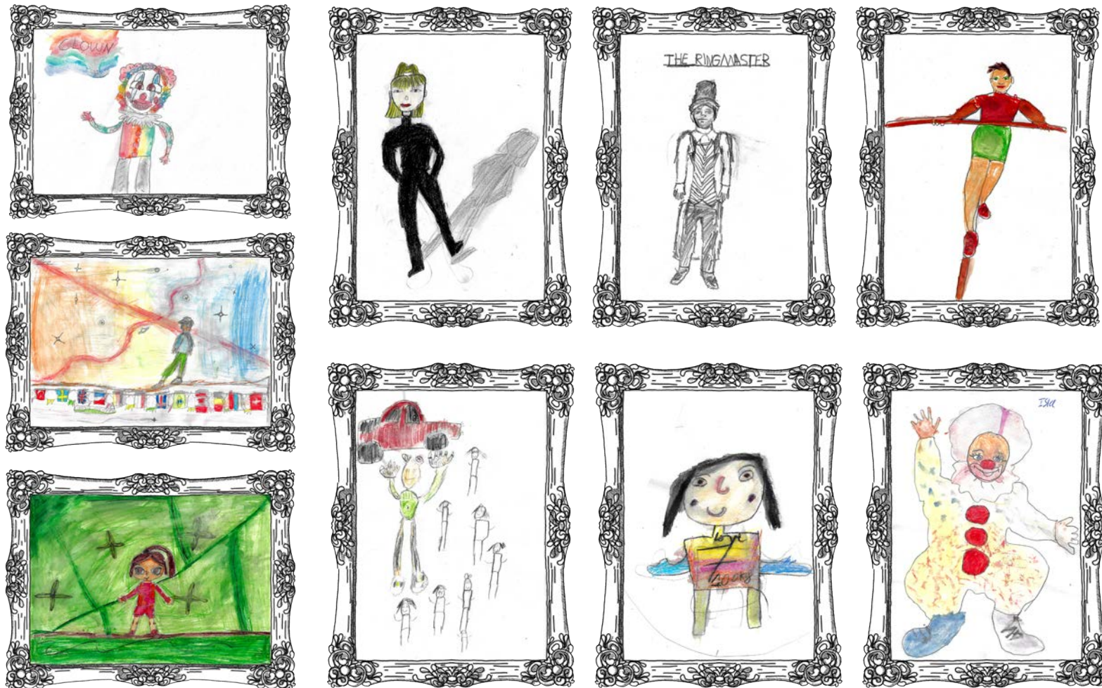
Fig.11b - The children's adaptations of their circus acts & characters

The children also created playful circus character names that brought a chuckle to all readers, adding a delightful touch to the workshops. We combined their creations into circus playbills and they were thrilled to see their characters featured in the exhibition.