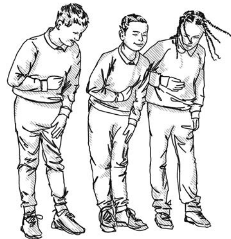
Fig.8a - Illustrations of the drama workshops held at Willow Park School