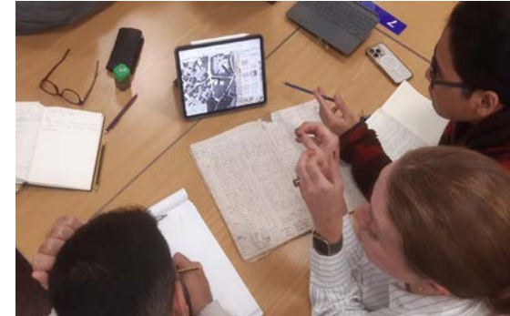
Fig.5 - Research at the Bristol Archives