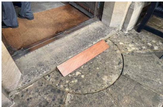
Fig.18 - Accessibility ramp

When we learned the exhibition would be held at the The Chapel of the Three Kings of Cologne, it was incredibly exciting. Not only is the chapel a more accessible location, but it also added a sense of uniqueness and charm to the event, as many had never been inside before. Working with DAB (Disability Activism Bristol) was instrumental in embedding accessibility into every aspect of the design, ensuring it was a fundamental principle, not an afterthought.