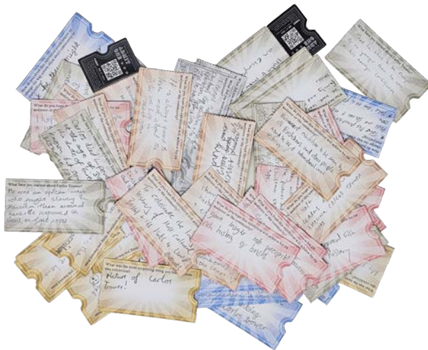
Fig.15 - Feedback Tickets received