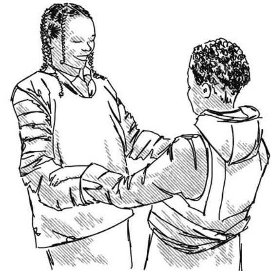
Fig.7 - Illustrations of the workshops held at Willow Park School