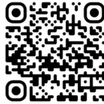
Fig.2 - QR for Local Learning About page

Local Learning is a community-focused organisation that creates educational and cultural projects to celebrate and preserve local history, heritage and identity. It collaborates with schools, artists, historians and local residents to bring untold stories to life through creative and participatory initiatives.