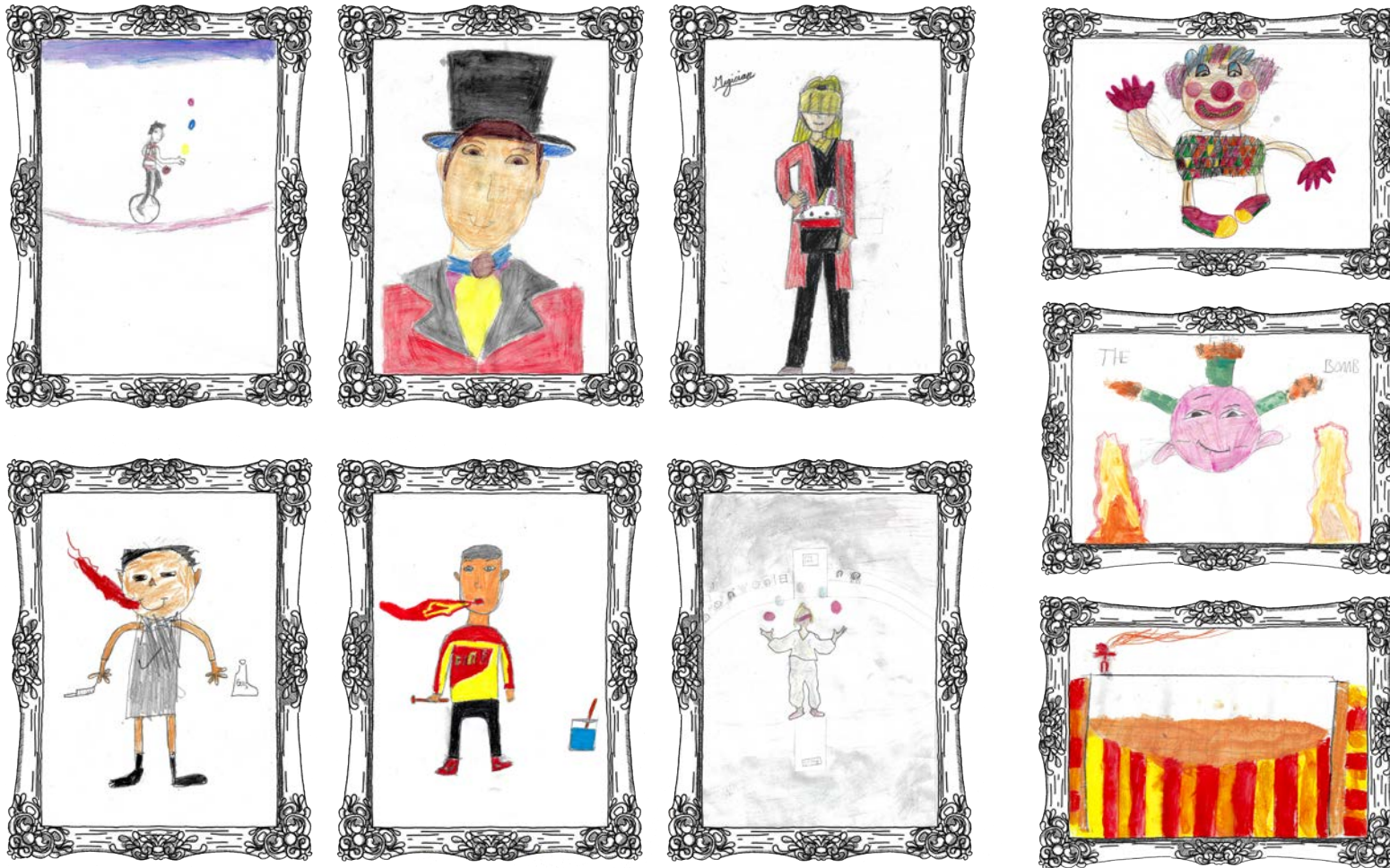
Fig.11a - The children's adaptations of their circus acts & characters

The children brought the circus to life through their imaginations, envisioning themselves as performers and creating vibrant sketches of their roles. Their work was a testament to their enthusiasm during the workshops, reflecting the inspiration they drew from Trower's story and David's impressions.