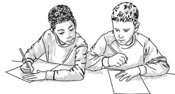
Fig.8b - Illustrations of the drama workshops held at Willow Park School