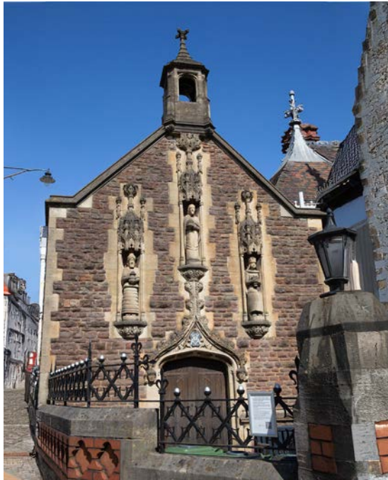
Fig.17 - The Chapel of the Three Kings of Cologne