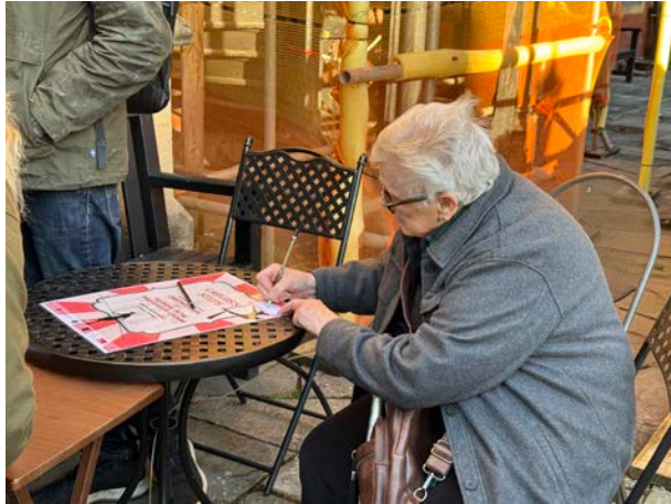
Fig.13 - A visitor leaving feedback at the exhibition