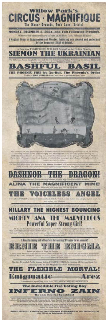
Fig.12a - The children's Circus acts created into Playbills