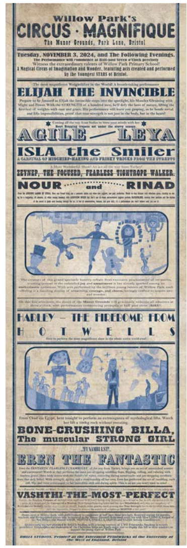
Fig.12b - The children's Circus acts created into Playbills