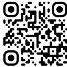
Fig.15 - QR for Rhiza Studio

Accessibility was a key focus from the start. Our goal was to ensure the exhibition could be experienced and enjoyed by everyone, regardless of ability. The design aimed to recreate the magic of walking through the Christmas Steps—a journey through history brought to life with lights and elevations, but in a more accessible setting.